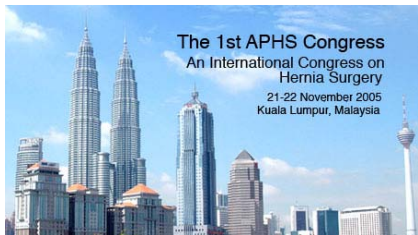
The 1st APHS Congress An International Congress on Hernia Surgery 21-22 November 2005 Kuala Lumpur, Malaysia